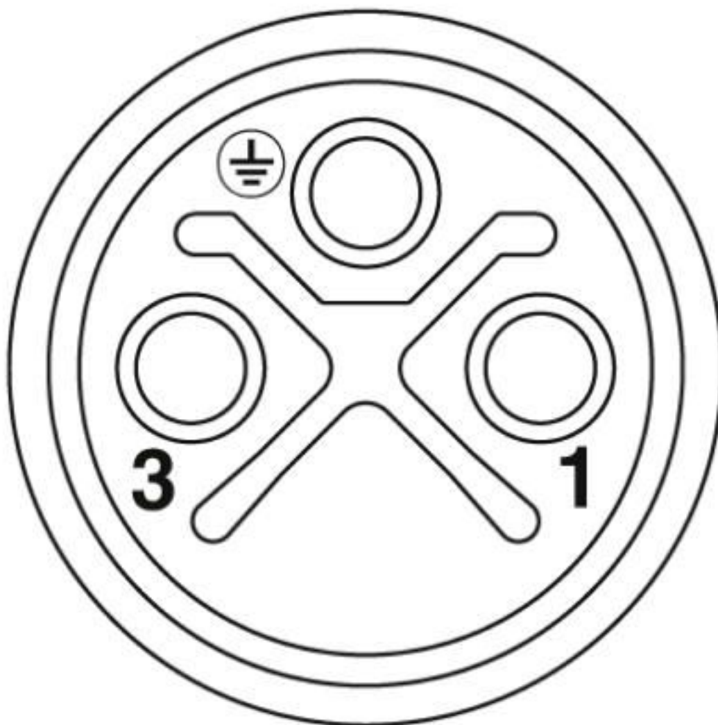
Pin assignment of M12 socket, 3-pos., S-coded, socket side view