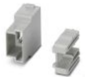
Contact insert module, number of positions: RJ45, type : RJ45, Pin, 50 V, 1 A, application: Data, with adapter for patch cables

Contact insert module - HC-M-RJ45-AD-PC-M - 1419885