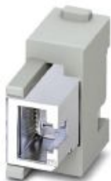
Contact insert module, number of positions: RJ45, type : RJ45, Socket, 50 V, 1 A, application: Data, Gender changer

Please be informed that the data shown in this PDF Document is generated from our Online Catalog. Please find the complete data in the user's documentation. Our General Terms of Use for Downloads are valid ( http://phoenixcontact.com/download )