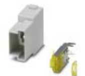
Contact insert module, number of positions: RJ45, type : RJ45, Pin, 50 V, 1 A, application: Data

Contact insert module - HC-M-RJ45-08-M - 1419887