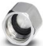
M12 metal sealing cap for unoccupied M12 plugs of the sensor/actuator cable, flush-type plugs and I/O devices in the field