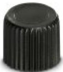
M12 sealing cap for unoccupied M12 plugs of the sensor/actuator cable, flush-type plugs and I/O devices in the field