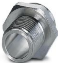
Housing screw connection with M12 standard thread, with O-ring, for 2-piece K, L, and M-coded THR contact carriers

Please be informed that the data shown in this PDF Document is generated from our Online Catalog. Please find the complete data in the user's documentation. Our General Terms of Use for Downloads are valid ( http://phoenixcontact.com/download )