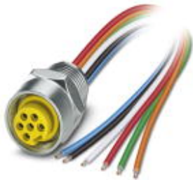
Sensor/actuator flush-type plug, 6-pos., 7/8", front mounting with 7/8" fastening thread, with 1.0 m PE litz wire

Please be informed that the data shown in this PDF Document is generated from our Online Catalog. Please find the complete data in the user's documentation. Our General Terms of Use for Downloads are valid ( http://phoenixcontact.com/download )