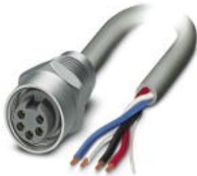
DeviceNet™ thin flush-type plug, 5-pos., 7/8", front mounting with 7/8" fastening thread, with 1.0 m PE litz wire

Please be informed that the data shown in this PDF Document is generated from our Online Catalog. Please find the complete data in the user's documentation. Our General Terms of Use for Downloads are valid ( http://phoenixcontact.com/download )