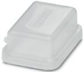
Protective covers, type: B6, degree of protection: IP20, color: transparent/white

Please be informed that the data shown in this PDF Document is generated from our Online Catalog. Please find the complete data in the user's documentation. Our General Terms of Use for Downloads are valid ( http://phoenixcontact.com/download )