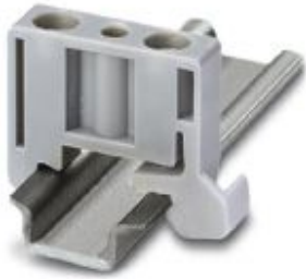
End clamp width: 6 mm, color: gray

Please be informed that the data shown in this PDF Document is generated from our Online Catalog. Please find the complete data in the user's documentation. Our General Terms of Use for Downloads are valid ( http://phoenixcontact.com/download )