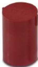
Closing cap, material: PA, color: red

Please be informed that the data shown in this PDF Document is generated from our Online Catalog. Please find the complete data in the user's documentation. Our General Terms of Use for Downloads are valid ( http://phoenixcontact.com/download )