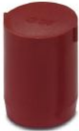
Closing cap, material: PA, color: red

Please be informed that the data shown in this PDF Document is generated from our Online Catalog. Please find the complete data in the user's documentation. Our General Terms of Use for Downloads are valid ( http://phoenixcontact.com/download )