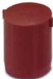
Closing cap, material: PA, color: red

Please be informed that the data shown in this PDF Document is generated from our Online Catalog. Please find the complete data in the user's documentation. Our General Terms of Use for Downloads are valid ( http://phoenixcontact.com/download )