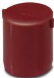
Closing cap, material: PA, color: red

Please be informed that the data shown in this PDF Document is generated from our Online Catalog. Please find the complete data in the user's documentation. Our General Terms of Use for Downloads are valid ( http://phoenixcontact.com/download )