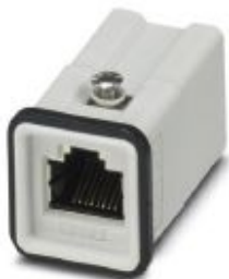
Contact insert, number of positions: RJ45, size: D7, type : RJ45, Socket, 50 V, 1 A, application: Data, Gender changer

Please be informed that the data shown in this PDF Document is generated from our Online Catalog. Please find the complete data in the user's documentation. Our General Terms of Use for Downloads are valid ( http://phoenixcontact.com/download )