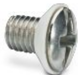
Sealing screw, size: Countersunk head, IP67, replacement part for D7 size HEAVYCON housing

Sealing screw - HC-D 7-DS-IP65 - 1686229