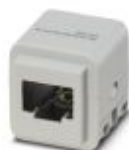
Contact insert, number of positions: RJ45, size: D7, type : RJ45, Pin, 50 V, 1 A, application: Data, with adapter for patch cables

Contact insert - HC-Q-I-RJ45-AD-PC-M - 1077120