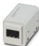
Contact insert, number of positions: RJ45, size: D7, type : RJ45, Pin, 50 V, 1 A, application: Data, with adapter for RJ industrial connector

Contact insert - HC-Q-I-RJ45-AD-PC-M - 1077120