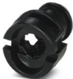
Protective hose adapter, for corrugated hoses with a nominal size of 13 (10 x 13), corrugated in parallel

Please be informed that the data shown in this PDF Document is generated from our Online Catalog. Please find the complete data in the user's documentation. Our General Terms of Use for Downloads are valid ( http://phoenixcontact.com/download )