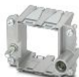
Module carrier frame, size: B6, type : for the panel mounting side (a, b, c, ...), 4 mm 2 ... 6 mm 2 , application: Module carrier frame

Module carrier frame - HC-M-B06-MFH-B - 1182085