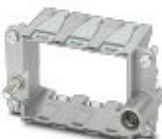
Module carrier frame, size: B10, type : for the panel mounting side (a, b, c, ...), 4 mm 2 ... 6 mm 2 , application: Module carrier frame

Module carrier frame - HC-M-B10-MFH-B - 1182088