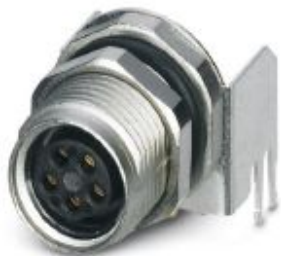
Sensor/actuator flush-type connector, socket, 5-pos., DeviceNet™, M8, rear/screw mounting with M10 fastening thread, with angled solder connection

Please be informed that the data shown in this PDF Document is generated from our Online Catalog. Please find the complete data in the user's documentation. Our General Terms of Use for Downloads are valid ( http://phoenixcontact.com/download )