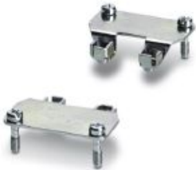
Adapter insert, type: D25

Please be informed that the data shown in this PDF Document is generated from our Online Catalog. Please find the complete data in the user's documentation. Our General Terms of Use for Downloads are valid ( http://phoenixcontact.com/download )