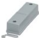
Protective cover, Protective covers, type: VC3, housing material: PA 6, color: gray