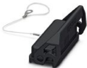
Protective cover D25, with single locking latch, protective cover material: PA, height: 19 mm

Please be informed that the data shown in this PDF Document is generated from our Online Catalog. Please find the complete data in the user's documentation. Our General Terms of Use for Downloads are valid ( http://phoenixcontact.com/download )