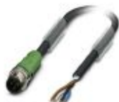
Sensor/actuator cable, 4-position, PUR, black-gray RAL 7021, Plug straight M12 SPEEDCON, coding: A, on free cable end, cable length: 2 m

Sensor/actuator cable - SAC-4P-MS/ 2,0-186 SCO - 1555606