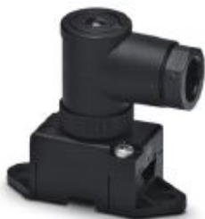
AS-Interface distributor with IP67 protection for 1 flat-ribbon conductor, 2-pos., with screw connection, angled

Please be informed that the data shown in this PDF Document is generated from our Online Catalog. Please find the complete data in the user's documentation. Our General Terms of Use for Downloads are valid ( http://phoenixcontact.com/download )