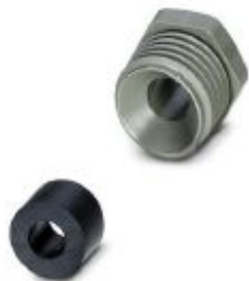
Sensor/actuator connector, accessories, pressure screw and seal, for unshielded M8 connector, cable diameter 2.2 mm - 3.5 mm

Please be informed that the data shown in this PDF Document is generated from our Online Catalog. Please find the complete data in the user's documentation. Our General Terms of Use for Downloads are valid ( http://phoenixcontact.com/download )