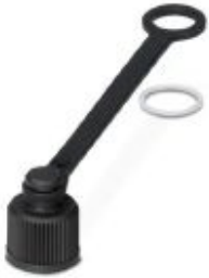
M8 sealing cap made of plastic with fixing band, for free M8 connectors, with 7.5 mm fastening eye

Please be informed that the data shown in this PDF Document is generated from our Online Catalog. Please find the complete data in the user's documentation. Our General Terms of Use for Downloads are valid ( http://phoenixcontact.com/download )