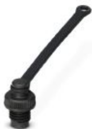
M8 sealing cap made of plastic with fixing band, for free M8 sockets, with 3.0 mm fastening eye

Please be informed that the data shown in this PDF Document is generated from our Online Catalog. Please find the complete data in the user's documentation. Our General Terms of Use for Downloads are valid ( http://phoenixcontact.com/download )