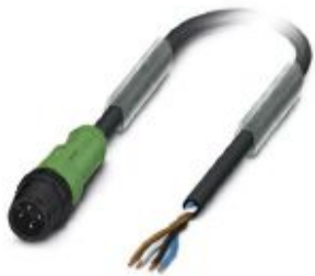
Sensor/actuator cable, 4-position, PUR halogen-free, black-gray RAL 7021, Plug straight M12, coding: A, on free cable end, cable length: 5 m, with plastic knurl

Please be informed that the data shown in this PDF Document is generated from our Online Catalog. Please find the complete data in the user's documentation. Our General Terms of Use for Downloads are valid ( http://phoenixcontact.com/download )