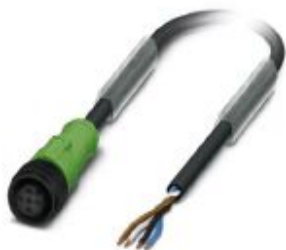
Sensor/actuator cable, 4-position, PUR halogen-free, black-gray RAL 7021, free cable end, on Socket straight M12, coding: A, cable length: 1.5 m, with plastic knurl

Please be informed that the data shown in this PDF Document is generated from our Online Catalog. Please find the complete data in the user's documentation. Our General Terms of Use for Downloads are valid ( http://phoenixcontact.com/download )