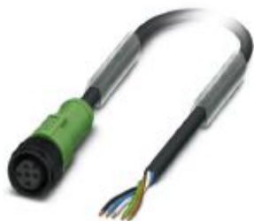
Sensor/actuator cable, 5-position, PUR halogen-free, black-gray RAL 7021, free cable end, on Socket straight M12, coding: A, cable length: 3 m, with plastic knurl

Please be informed that the data shown in this PDF Document is generated from our Online Catalog. Please find the complete data in the user's documentation. Our General Terms of Use for Downloads are valid ( http://phoenixcontact.com/download )