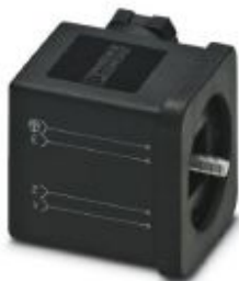
Valve connectors, Universal, 4-position, Valve connector AD (pressure switch), Screw connection, cable gland M16, external cable diameter 6 mm ... 8 mm

Please be informed that the data shown in this PDF Document is generated from our Online Catalog. Please find the complete data in the user's documentation. Our General Terms of Use for Downloads are valid ( http://phoenixcontact.com/download )