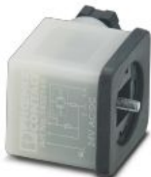
Valve connectors, Universal, 3-position, Valve connector A, with 1 LED, connected with Varistor, Screw connection, cable gland M16, external cable diameter 6 mm ... 8 mm

Please be informed that the data shown in this PDF Document is generated from our Online Catalog. Please find the complete data in the user's documentation. Our General Terms of Use for Downloads are valid ( http://phoenixcontact.com/download )