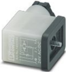
Valve connectors, Universal, 3-position, Valve connector BI (11 mm), with 1 LED, connected with Varistor, Screw connection, cable gland M16, external cable diameter 6 mm ... 8 mm

Please be informed that the data shown in this PDF Document is generated from our Online Catalog. Please find the complete data in the user's documentation. Our General Terms of Use for Downloads are valid ( http://phoenixcontact.com/download )