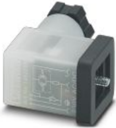
Valve connectors, Universal, 3-position, Valve connector CI (9.4 mm), with 1 LED, connected with Varistor, Screw connection, cable gland M12, external cable diameter 4 mm ... 6 mm

Please be informed that the data shown in this PDF Document is generated from our Online Catalog. Please find the complete data in the user's documentation. Our General Terms of Use for Downloads are valid ( http://phoenixcontact.com/download )