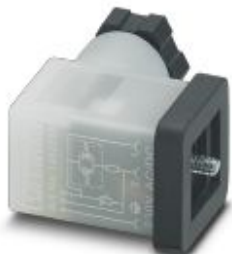
Valve connectors, Universal, 3-position, Valve connector CI (9.4 mm), with 1 LED, connected with Varistor, Screw connection, cable gland M12, external cable diameter 4 mm ... 6 mm

Please be informed that the data shown in this PDF Document is generated from our Online Catalog. Please find the complete data in the user's documentation. Our General Terms of Use for Downloads are valid ( http://phoenixcontact.com/download )