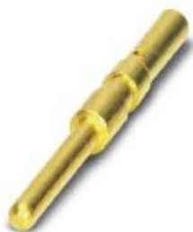
Crimp contact, diameter 1 mm, for all 3 to 5-pos. contact inserts, crimp range from 0.08 mm 2 - 0.34 mm 2 .

Please be informed that the data shown in this PDF Document is generated from our Online Catalog. Please find the complete data in the user's documentation. Our General Terms of Use for Downloads are valid ( http://phoenixcontact.com/download )