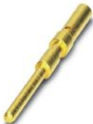
Crimp contact, diameter 0.8 mm, for the 8-pos. contact insert, crimp range from 0.08 mm 2 - 0.34 mm 2 .

Please be informed that the data shown in this PDF Document is generated from our Online Catalog. Please find the complete data in the user's documentation. Our General Terms of Use for Downloads are valid ( http://phoenixcontact.com/download )