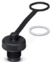
M12 sealing cap with fixing band, for free M12 sockets with 14.5 mm fastening eye

Please be informed that the data shown in this PDF Document is generated from our Online Catalog. Please find the complete data in the user's documentation. Our General Terms of Use for Downloads are valid ( http://phoenixcontact.com/download )