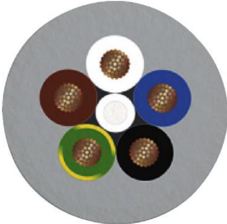
Cable cross section

PUR halogen-free highly flexible resistant to welding sparks gray 5th conductor green/yellow [802]