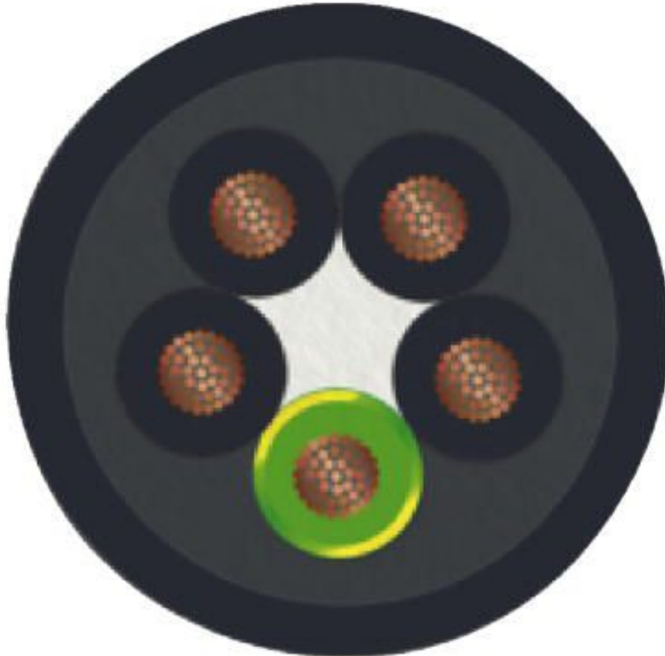
Cable cross section