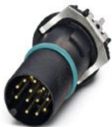
Sensor/actuator flush-type plug, 12-pos. with shroud, A-coded, with straight THR solder connection, contact insert only

Please be informed that the data shown in this PDF Document is generated from our Online Catalog. Please find the complete data in the user's documentation. Our General Terms of Use for Downloads are valid ( http://phoenixcontact.com/download )