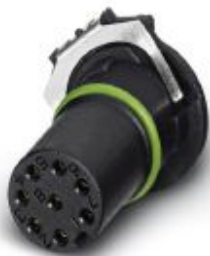
Sensor/actuator flush-type socket, 8-pos., with straight THR solder connection, only contact insert

Please be informed that the data shown in this PDF Document is generated from our Online Catalog. Please find the complete data in the user's documentation. Our General Terms of Use for Downloads are valid ( http://phoenixcontact.com/download )