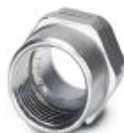
Housing screw connection with M12 standard thread, with O-ring, for the two-piece straight M12 THR contact carrier and for the two-piece angled M12 contact carrier

Housing screw connection - SACC-DSIV-M12-NUT - 1416144