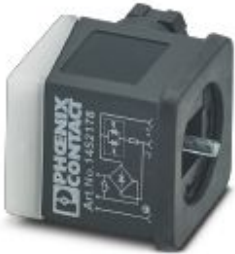
Valve connectors, Universal, 5-position, Valve connector AD (pressure switch), with 2 LEDs, Screw connection, cable gland M16, external cable diameter 6 mm ... 8 mm

Please be informed that the data shown in this PDF Document is generated from our Online Catalog. Please find the complete data in the user's documentation. Our General Terms of Use for Downloads are valid ( http://phoenixcontact.com/download )