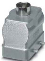
HEAVYCON B10 sleeve housing, for double locking latch, height: 56 mm, with 1 x M20 gland, straight cable outlet

Please be informed that the data shown in this PDF Document is generated from our Online Catalog. Please find the complete data in the user's documentation. Our General Terms of Use for Downloads are valid ( http://phoenixcontact.com/download )