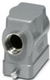
HEAVYCON sleeve housing B10, for single locking latch, height 72 mm, with support 1x M25, lateral conductor exit

Please be informed that the data shown in this PDF Document is generated from our Online Catalog. Please find the complete data in the user's documentation. Our General Terms of Use for Downloads are valid ( http://phoenixcontact.com/download )