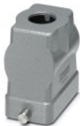
HEAVYCON B10 sleeve housing, for single locking latch, height: 72 mm, with 1 x M20 thread, straight cable outlet

Please be informed that the data shown in this PDF Document is generated from our Online Catalog. Please find the complete data in the user's documentation. Our General Terms of Use for Downloads are valid ( http://phoenixcontact.com/download )