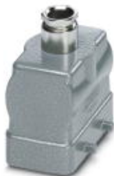
HEAVYCON B10 sleeve housing, for double locking latch, height: 56 mm, with 1 x Pg16 screw connection, straight cable outlet

Please be informed that the data shown in this PDF Document is generated from our Online Catalog. Please find the complete data in the user's documentation. Our General Terms of Use for Downloads are valid ( http://phoenixcontact.com/download )