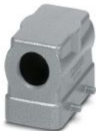
HEAVYCON B10 sleeve housing, for double locking latch, height: 56 mm, with 1 x M25 thread, lateral cable outlet

Please be informed that the data shown in this PDF Document is generated from our Online Catalog. Please find the complete data in the user's documentation. Our General Terms of Use for Downloads are valid ( http://phoenixcontact.com/download )