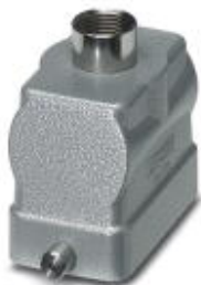
HEAVYCON sleeve housing, for single locking latch, height: 56 mm, with gland, 1 x M20, straight cable outlet

Please be informed that the data shown in this PDF Document is generated from our Online Catalog. Please find the complete data in the user's documentation. Our General Terms of Use for Downloads are valid ( http://phoenixcontact.com/download )