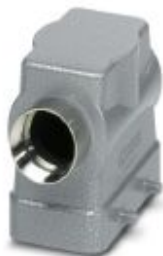
HEAVYCON B10 sleeve housing, for double locking latch, height: 72 mm, with 1 x Pg29 gland, lateral cable outlet

Please be informed that the data shown in this PDF Document is generated from our Online Catalog. Please find the complete data in the user's documentation. Our General Terms of Use for Downloads are valid ( http://phoenixcontact.com/download )