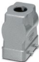
HEAVYCON B10 sleeve housing, for double locking latch, height: 72 mm, with 1 x M32 thread, straight cable outlet

Please be informed that the data shown in this PDF Document is generated from our Online Catalog. Please find the complete data in the user's documentation. Our General Terms of Use for Downloads are valid ( http://phoenixcontact.com/download )