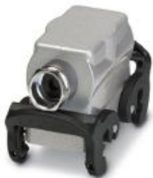
HEAVYCON B10 sleeve housing, with double locking latch, height 56 mm, with screw connection 1 x Pg16, lateral cable outlet

Please be informed that the data shown in this PDF Document is generated from our Online Catalog. Please find the complete data in the user's documentation. Our General Terms of Use for Downloads are valid ( http://phoenixcontact.com/download )