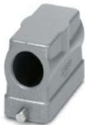
HEAVYCON B16 sleeve housing, for single locking latch, height: 65 mm, with 1 x M25 thread, lateral cable outlet

Please be informed that the data shown in this PDF Document is generated from our Online Catalog. Please find the complete data in the user's documentation. Our General Terms of Use for Downloads are valid ( http://phoenixcontact.com/download )