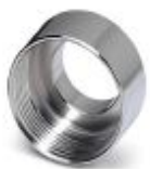
Step-up adapter, M32 to M40, including O-ring

Extension adapter - ENLAR-M-KV-M32/M40 - 1647682