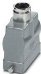
HEAVYCON B16 sleeve housing, for single locking latch, height: 76 mm, with 1 x Pg29 screw connection, straight cable outlet

Please be informed that the data shown in this PDF Document is generated from our Online Catalog. Please find the complete data in the user's documentation. Our General Terms of Use for Downloads are valid ( http://phoenixcontact.com/download )